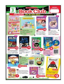
Crazy Hair Day

Book Club issue 3 has been sent home today. Orders are due in by the 3<sup>rd</sup> May 2024. Please note we can only accept Loop online orders at the moment as we cannot process cash at present.